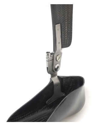
Open Pocket Lamination Technique

The Fabrication Tool Kit (3A00-FTK) is designed for open pocket lamination technique, or thermoforming of Triple Action AFO's. Laminated double upright orthoses fabricated using the recommended composite layup in Table 1 will typically achieve the appropriate stiffness for Triple Action AFO's. Open pocket design unilateral AFO's require Camber Axis Triple Action Companion Joint, or other free motion ankle joint. Encapsulated design unilateral AFO's do not require a companion joint.